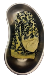
A very expensive sock that was removed from the intestines of a dog

So – as well as trying to ensure your pets don’t eat these objects, we strongly recommend pet insurance to cover you against these unexpected eventualities!